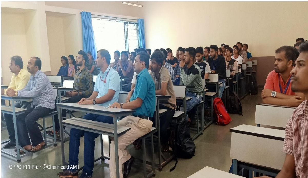
Faculty & Students during the seminar