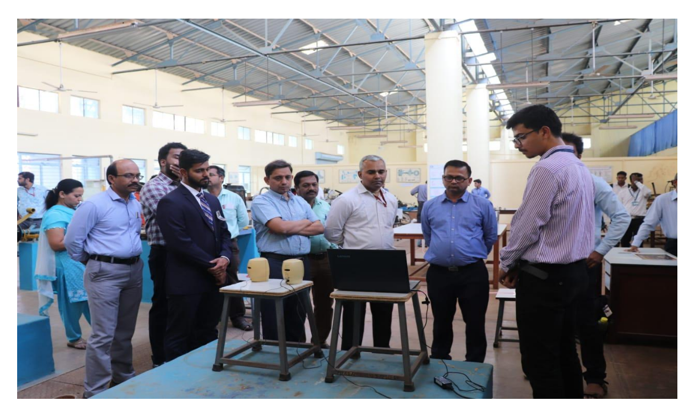
Students Explaining Different Automotive systems