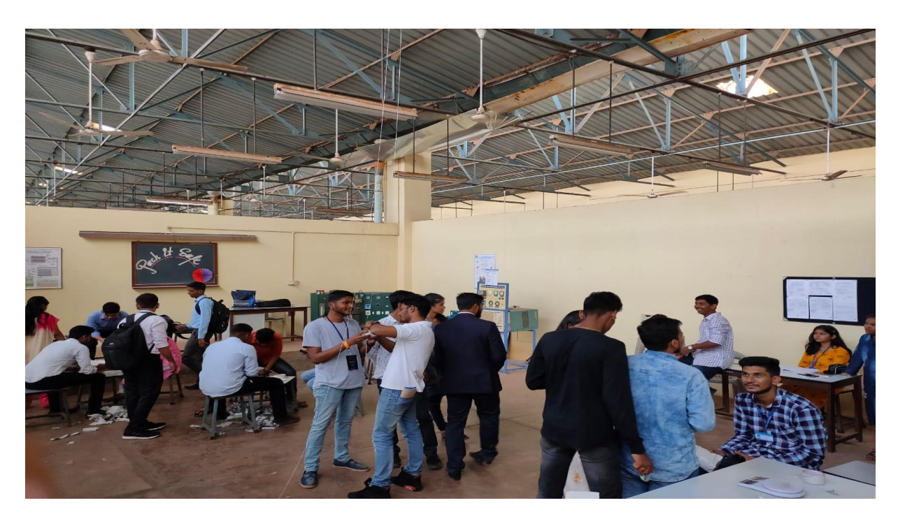
PACK IT SAFE: Students will have a brief idea about the concepts and consideration during the process of packaging