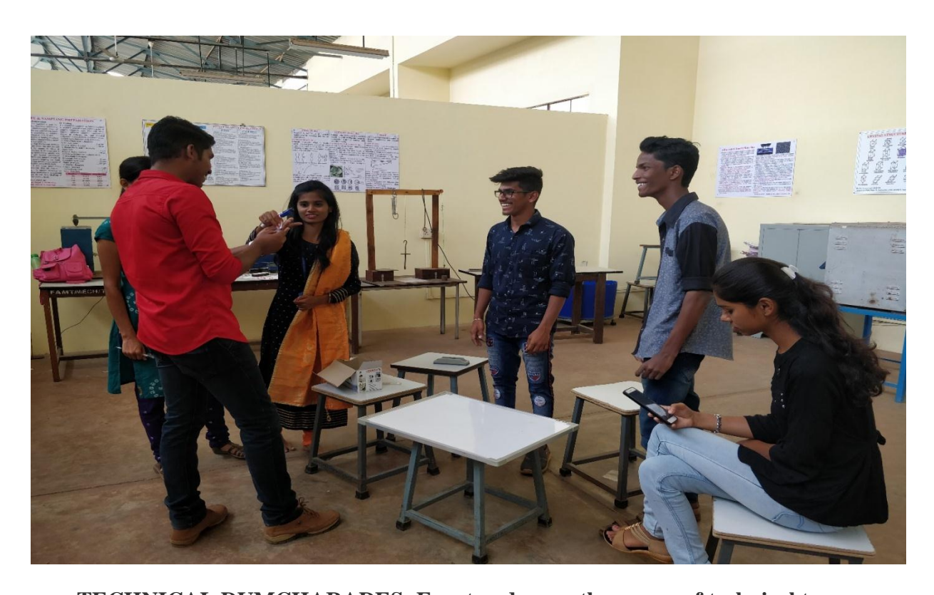
TECHNICAL DUMCHARADES: Enact and guess the names of technical terms