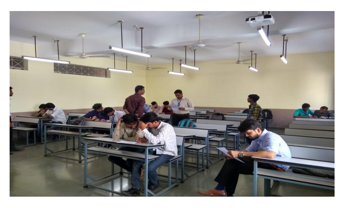
TECH WIZARDS: To improve the technical skills and general knowledge of students.