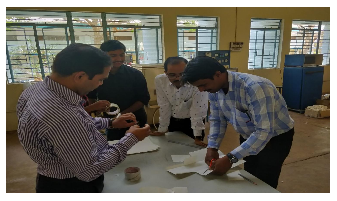
Teacher's participated in pack it safe event