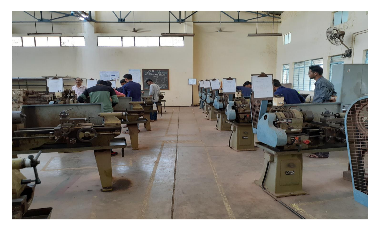
LATHE WAR: Learn the skill on the Lathe machine along with the safety aspects