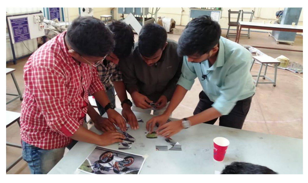
TEAM TASK FORCE: An innovative event with logical games which the students have to complete in given constraints and time to boost their creativity