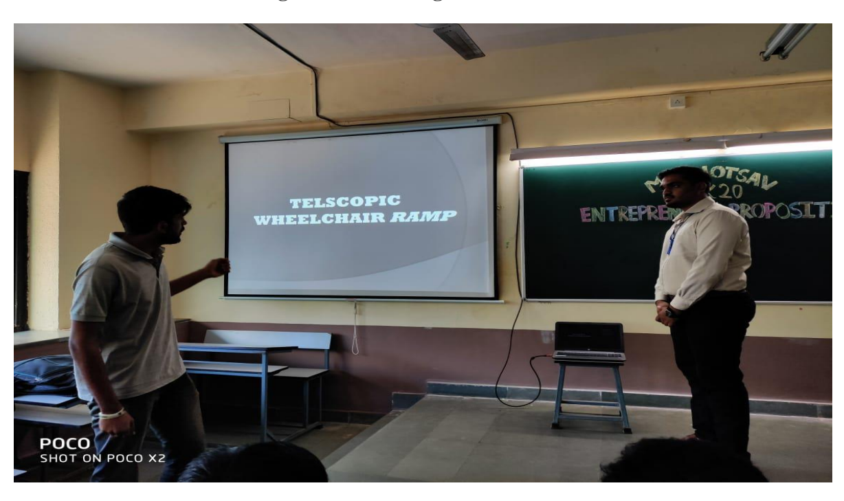
ENTREPRENEUR'S PROPOSITION: To enhance the skill of research paper literature survey and presentation