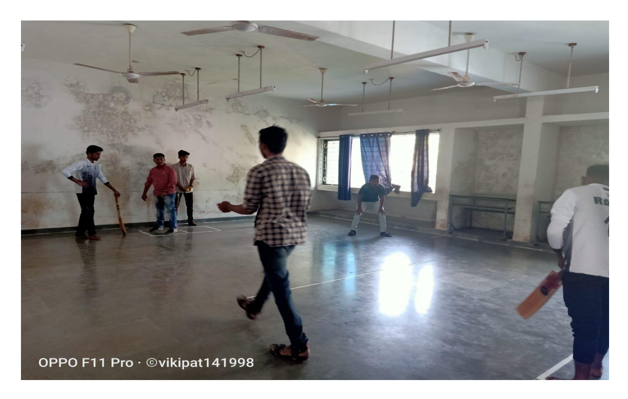
BOX CRICKET: Extra-Curricular Event received a huge response