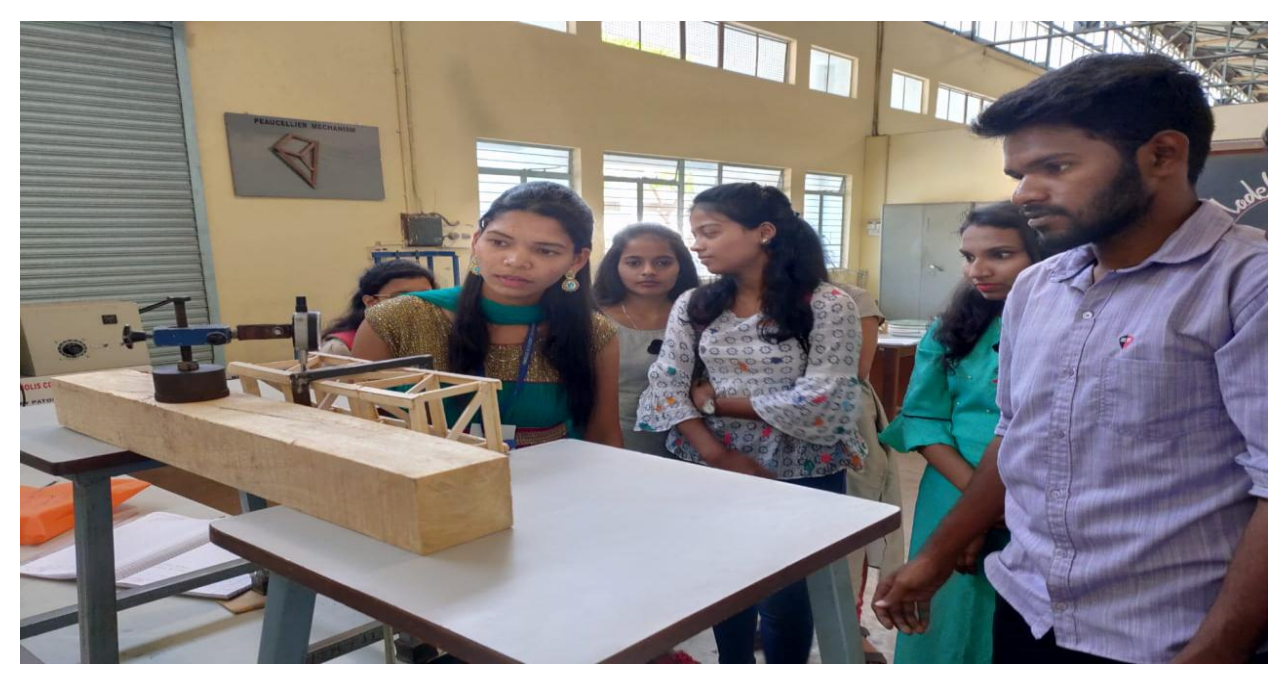
MODEL MAKING: Learn to implement the concepts of Strength of material and Mechanics in actual