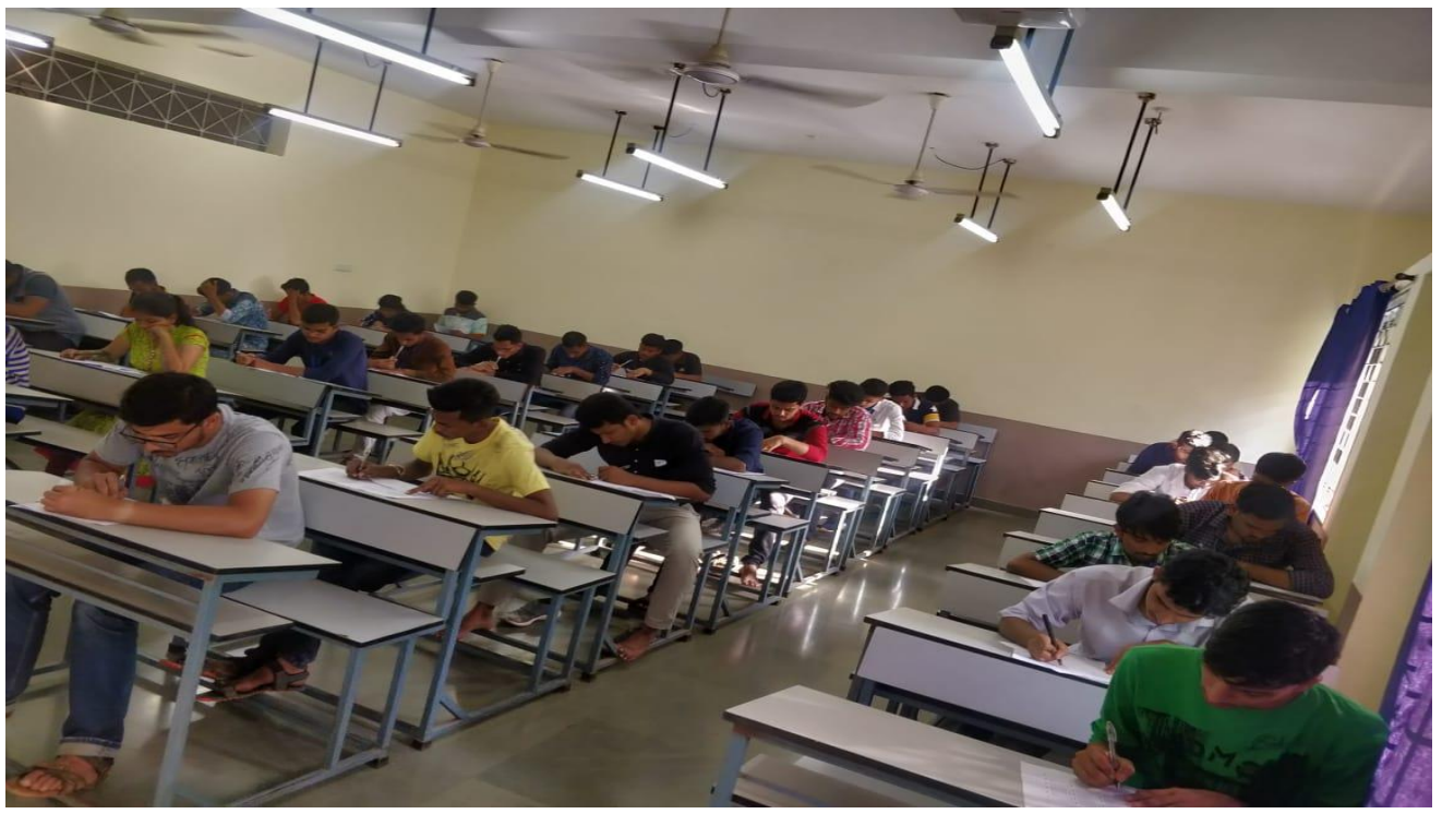
MOCK PLACEMENT DRIVE: To improve the technical skills, communication skill and general knowledge of students.