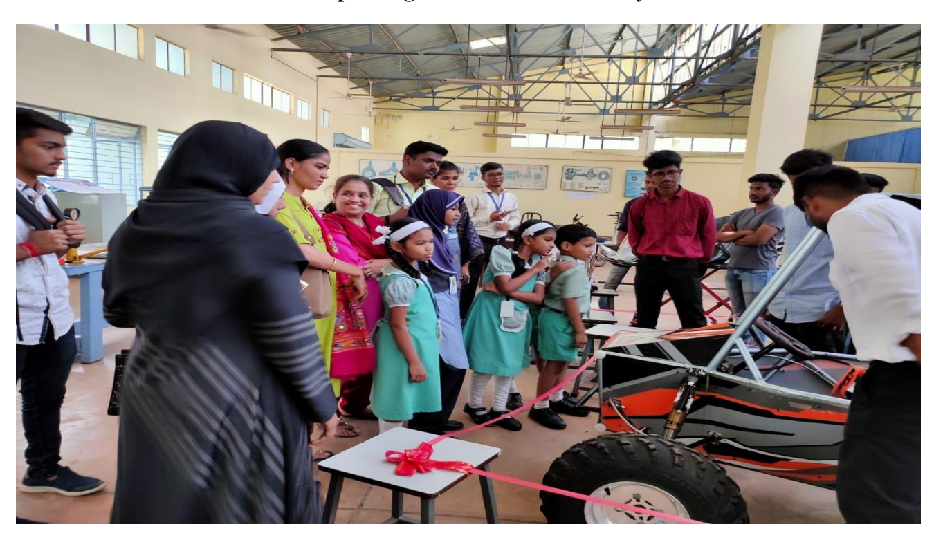
School students visit to Mechotsav & Autotech 2k20