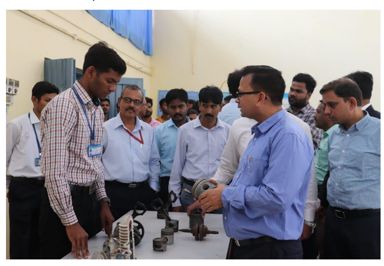
Students Explaining Basic Systems of Automobile Engines