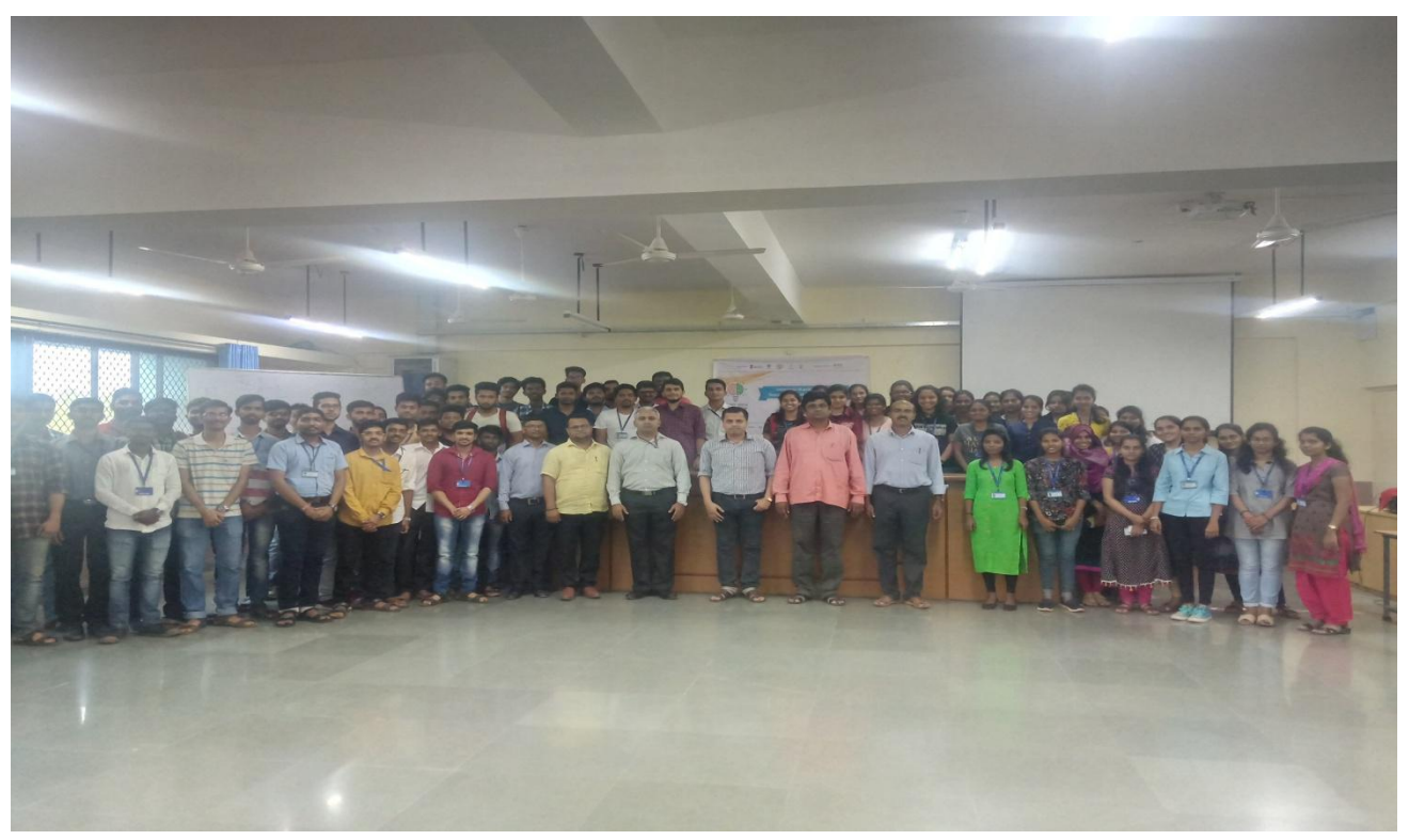
Internal Hackathon Participants with Jury