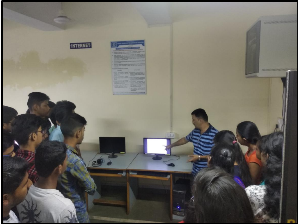
User Awareness & Orientation Program For First Year Batch - 2019-20