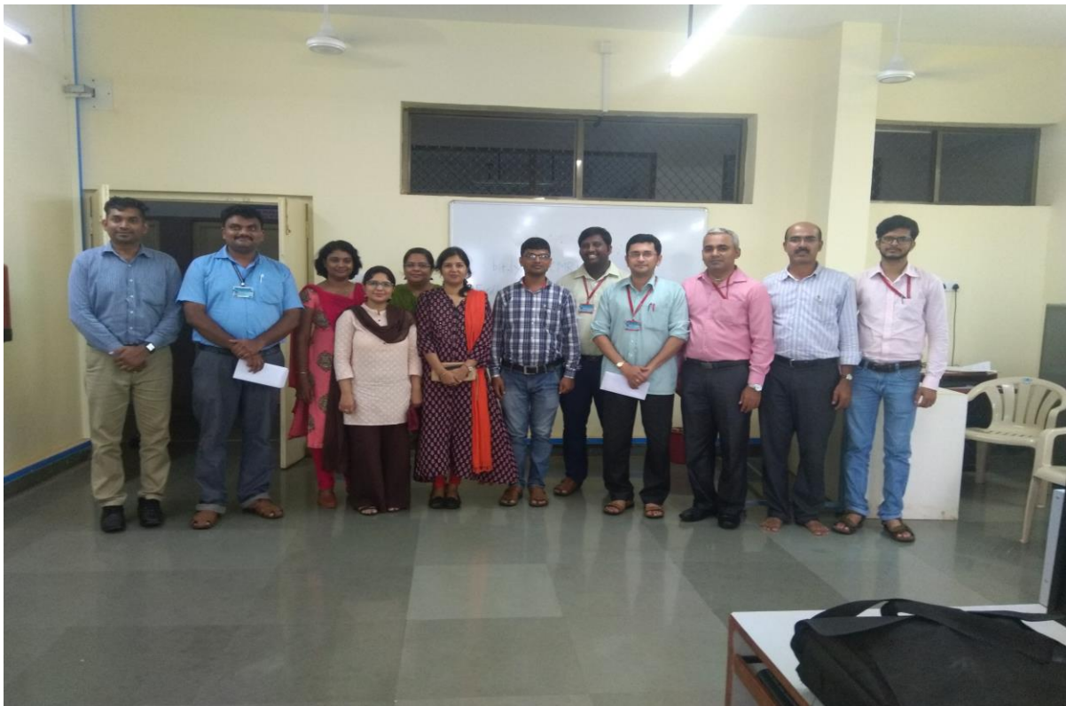
Valediction of ceremony of STTP