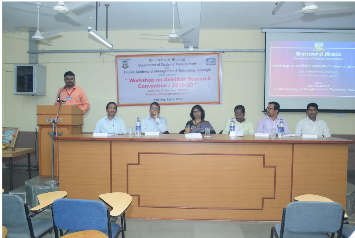
Inaugural function of Workshop on Avishkar Research Convention: 2019-20