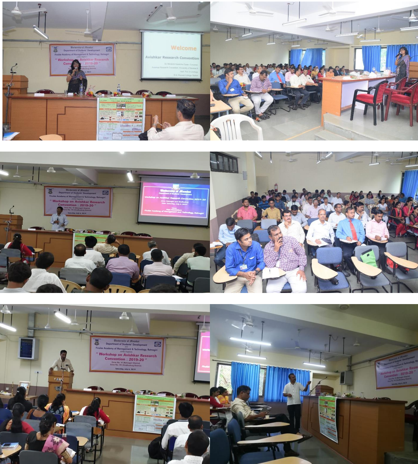
Sessions conducted by Resource persons and Participants during the Workshop