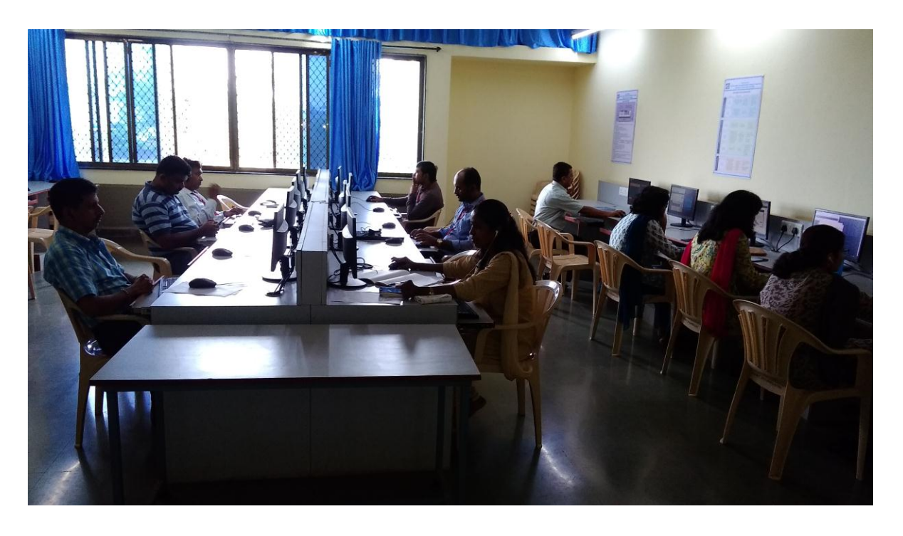
Participants attending hands-on-session