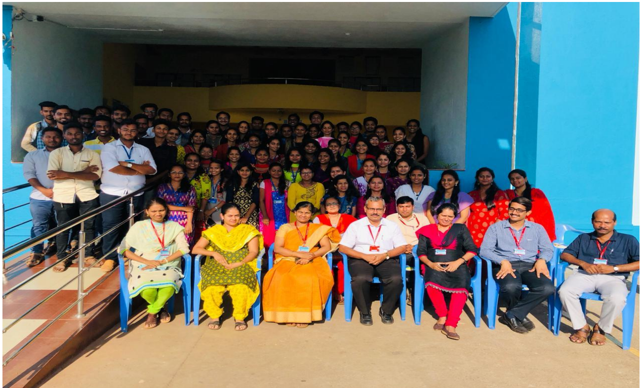
BE E&TC at Farewell-2K19