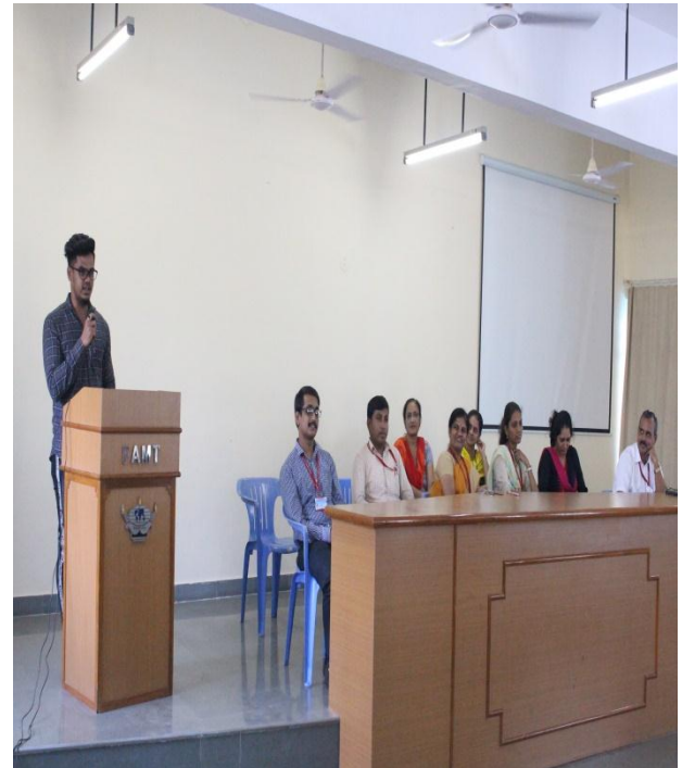
Students of BE E&TC sharing their experience about E&TC Department